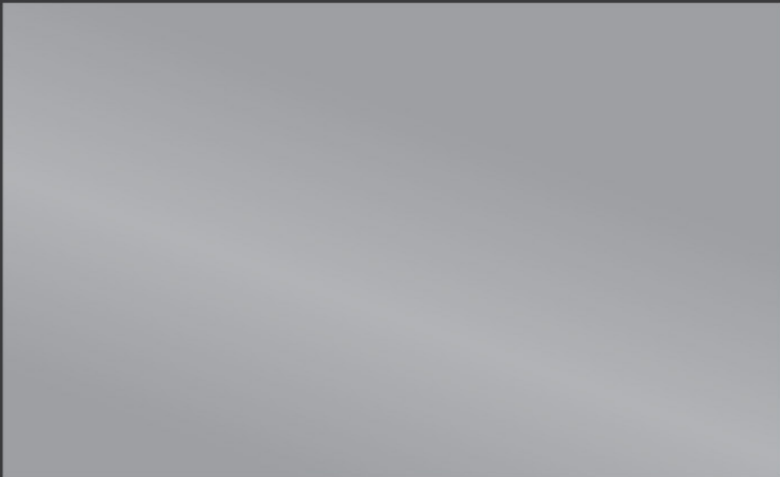
3M FX Premium Automotive Window Films