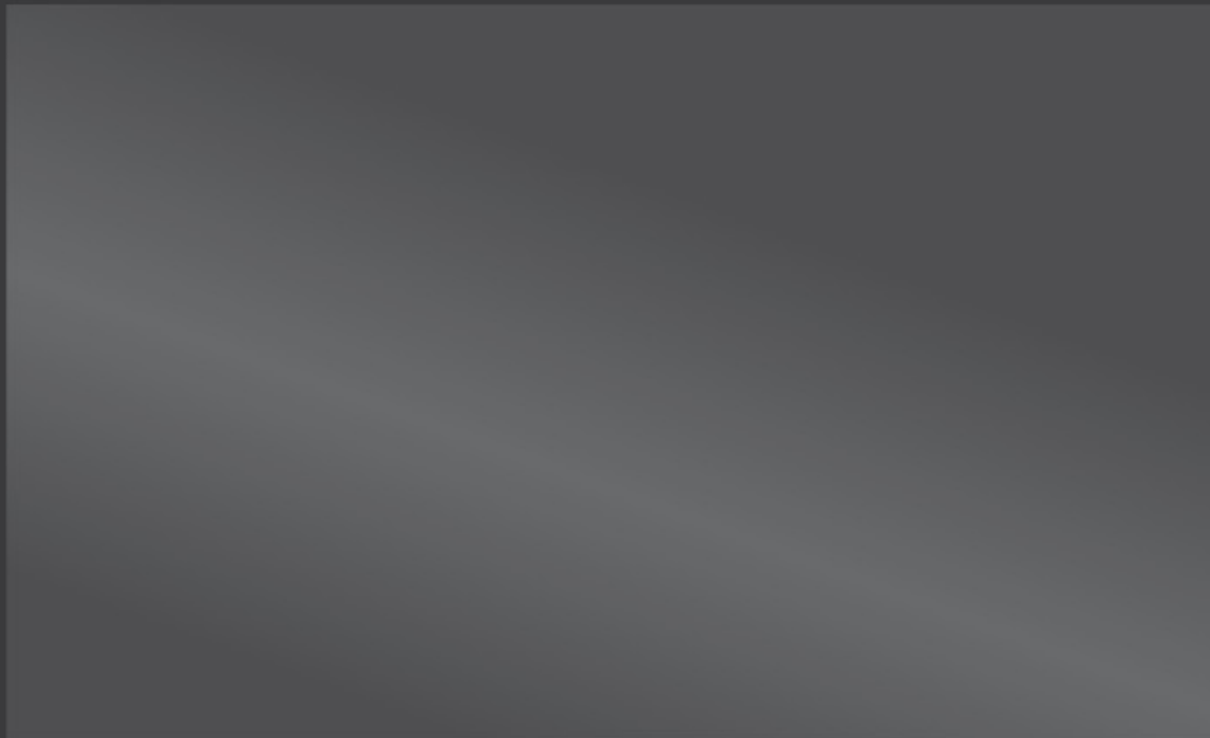
3M FX Premium Automotive Window Films