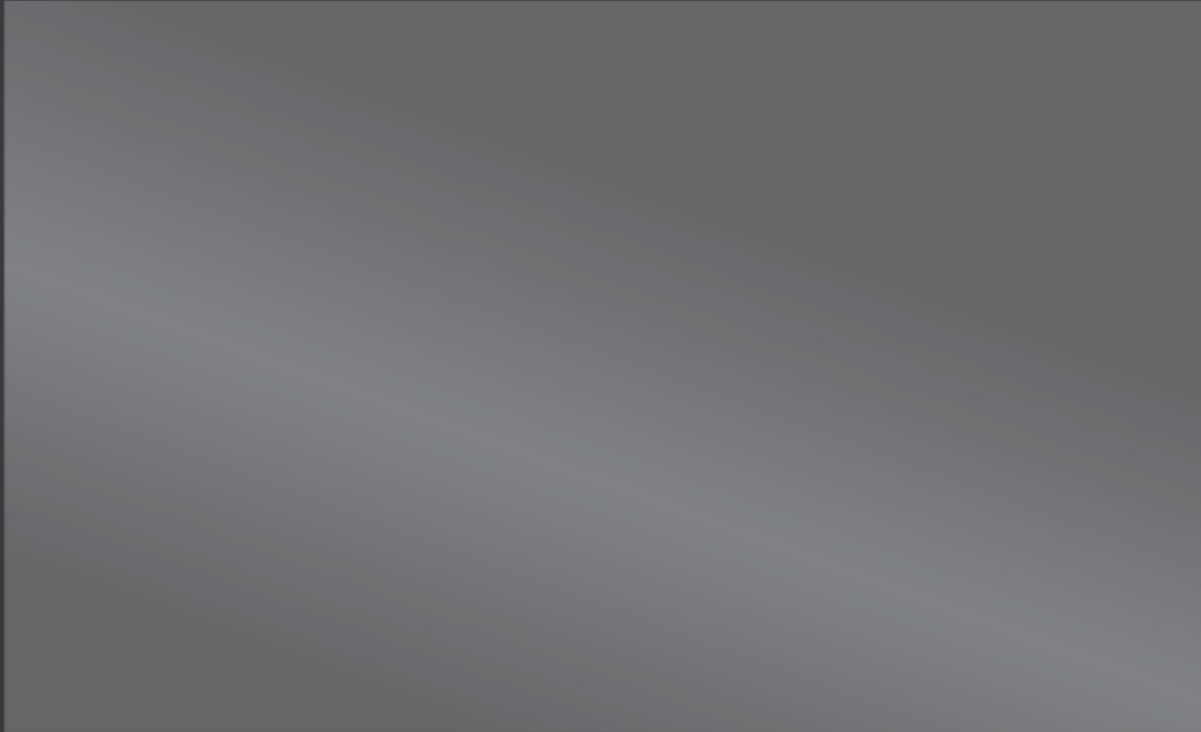
3M FX Premium Automotive Window Films