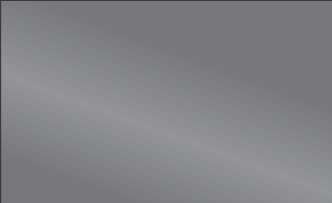
3M FX Premium Automotive Window Films